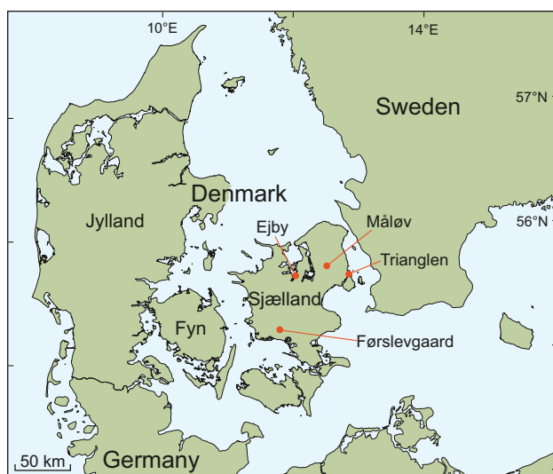
Fig. 1 Map of Denmark showing the location of Ejby and other Middle Pleistocene interglacial deposits on Sjælland discussed in the text.

Invertebrates are represented by shells of the bivalve Corbicula fluminalis (Fig. 3). The Pleistocene occurrence of this species was discussed by Meijer & Preece (2000), who concluded that the species was present only in temperate stages. Although mainly a fresh-water species that lives in rivers, it may have been able to tolerate slightly brackish conditions. It occurred in north-western Europe during the Early and Middle Pleistocene, whereas it was absent during the Last Interglacial. In Denmark, it has been found in interglacial deposits from the former Free Port in Copenhagen (Johansen 1904), a deposit nowadays referred to MIS 7 (Bennike et al. 2019). The species has also been reported from an interglacial deposit at Førslevgaard in southern Sjælland (Johansen 1904; location in Fig. 1). The age of the deposit at Førslevgaard is unknown, but its fauna indicates a Middle Pleistocene age.