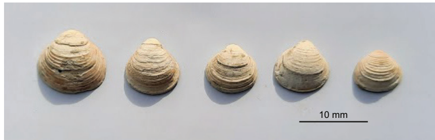
Fig. 3 Five shells of Corbicula fluminalis from Ejby.