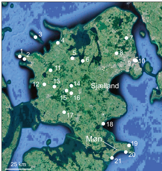
Fig. 4 Google Earth image of Sjælland and Møn showing localities mentioned in the text. 1: Slettenshage. 2: Skambæks Mølle. 3: Sejerø. 4: Høve. 5: Holbæk. 6: Ejby. 7: Nebbegaard. 8: Måløv. 9: Trianglen. 10: the former Free Port in Copenhagen. 11: Holmstrup. 12: Høng. 13: Nordrup. 14: Gyrrstinge. 15: Bjernede. 16: Fjenneslev. 17: Førslevgaard. 18: Strandegaards Dyrehave. 19: Stubberup Have. 20: Kobbegård/Klintholm. 21: Hjem Nakke.

(Miller & Mangerud 1985). Another interglacial deposit from Røsnæs, near Skambæks Mølle (Madsen et al. 1908), may be of the same age.