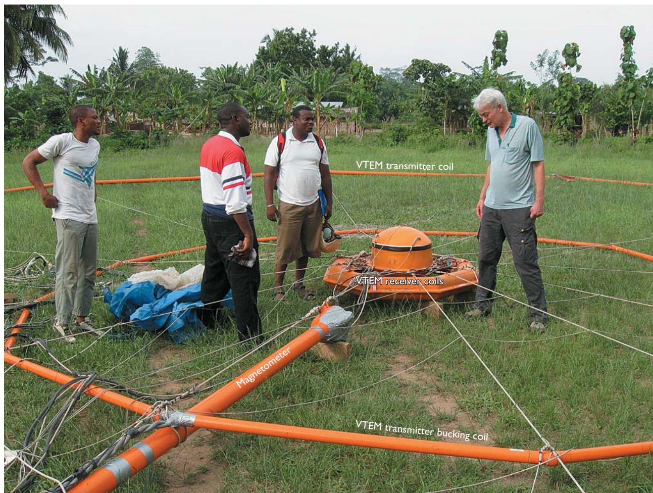
Fig. 2. The first author (right) discusses the methods of the VTEM system during a break in the surveying of the Akwatia block with the Geotech operators. The outer transmitter coil has a diameter of \approx 26 m and carries a current of \approx 200 A before turn-off of the transient signal.

Initially, the surveys planned were mainly directed towards obtaining an understanding of the geology of the two basin areas and only included those performed by Fugro.